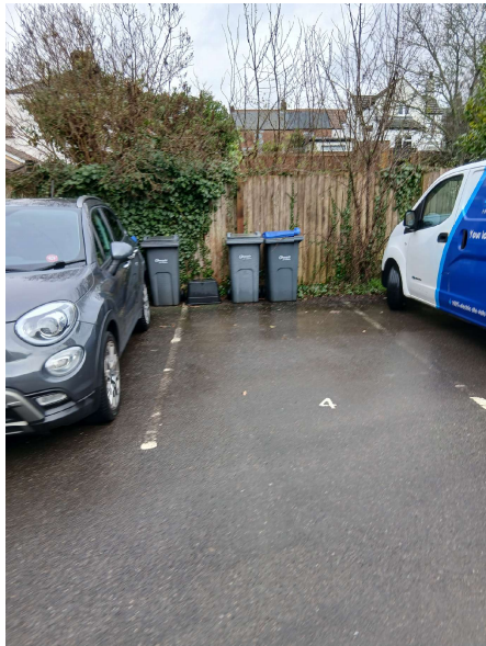
Bin Store (Waste Disposal Area)