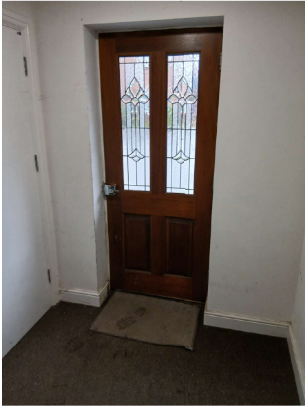
Entrances (Main Doors)