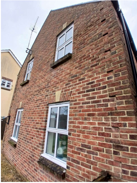
Exterior Structure (The Building)