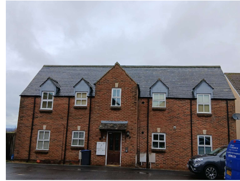
Roofing (Tiles and Cladding)