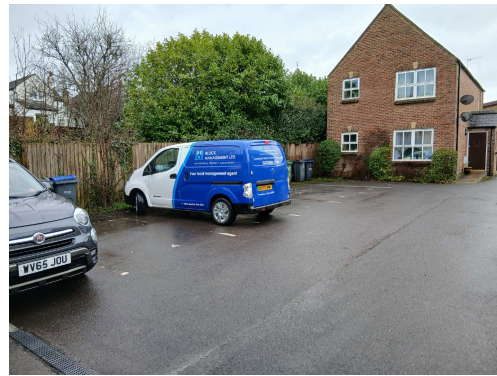
Car Park (Vehicle Parking)