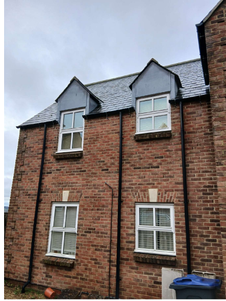
Guttering (Gutters and Fascia)