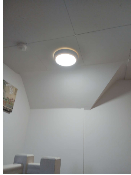
Lighting (Standard and Emergency Lights)