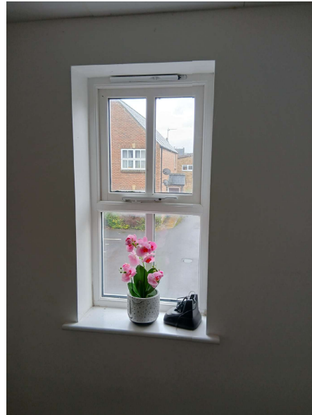
Windows (Communal Windows)