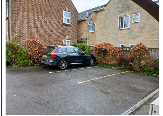
Communal Grounds (Gardens and Common Areas)